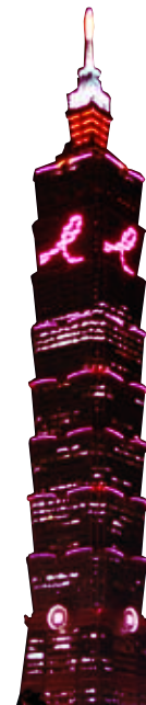
Taipei 101, Taipei, Taiwan

The First Lady of Panama, Mrs. Vivian Fernández de Torrijos, was instrumental in the creation of a special-edition Pink Ribbon currency in Panama.